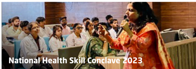
National Health Skill Conclave 2023