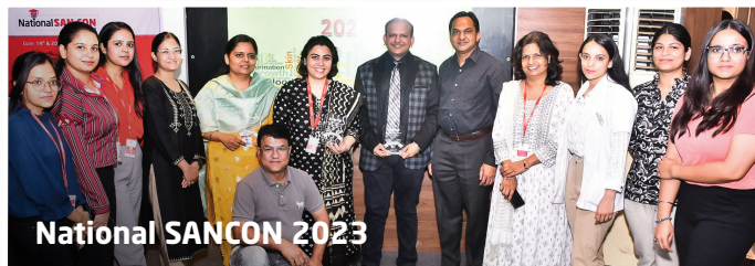
National SANCON 2023